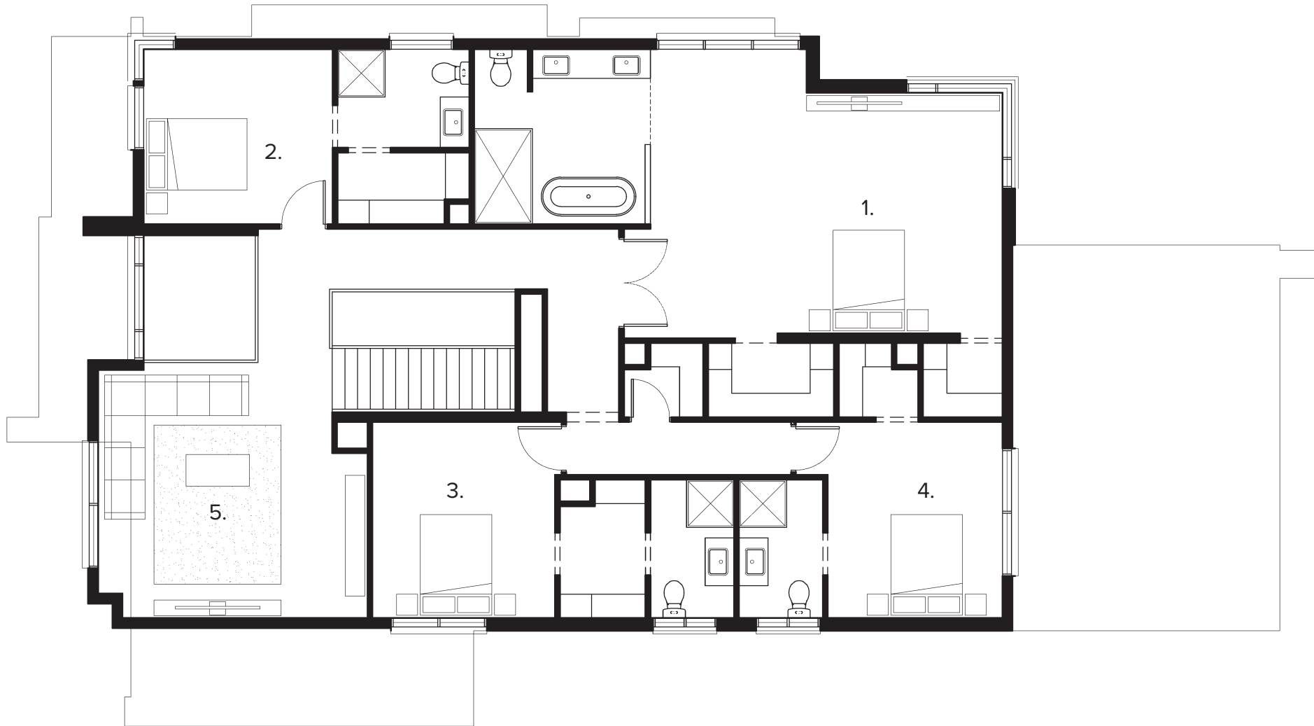
Typical Bespoke first floor plan.